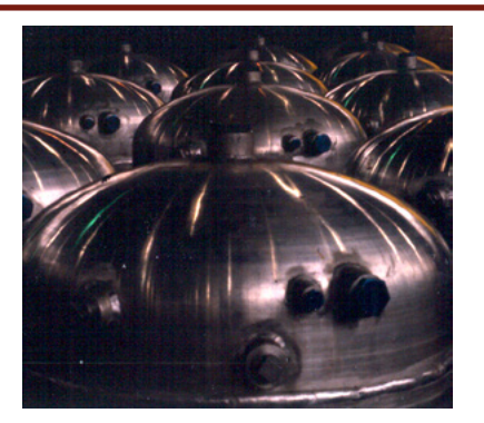
Aluminim hydraulic tanks used in hydrofoil boats.

Our experience assures proper welding and fabrication techniques that maintain the full corrosion resisting performance of the alloys used.