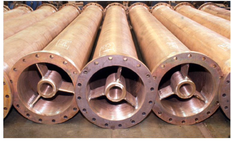
Coper-nickel pipe used in of-shore sulfur mining as a seawater supply line and pump shaft support.