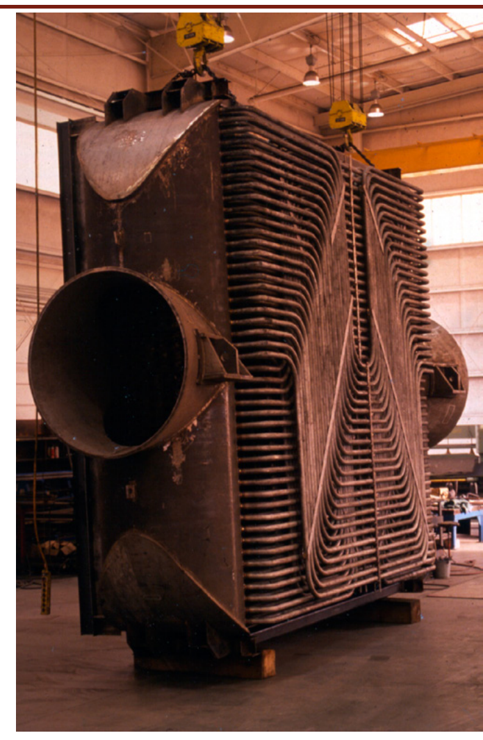
Type 321 stainless steel natural gas-fired autoclave heat exchanger.