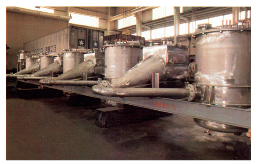
Stainless steel nitration system.

Stainless steel vacuum chamber used for free-electron laser experimentation.